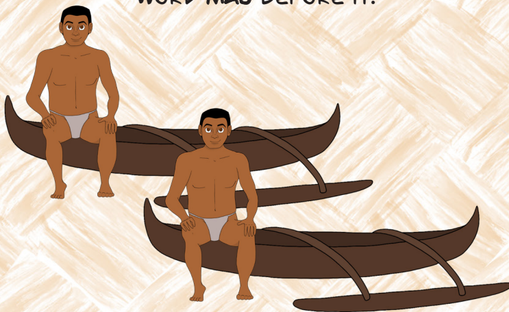
KO NĀ KĀNE MAU WA'A = THE MEN'S CANOES

TO PLURALIZE THE POSSESSION, USE THE WORD MAU BEFORE IT: