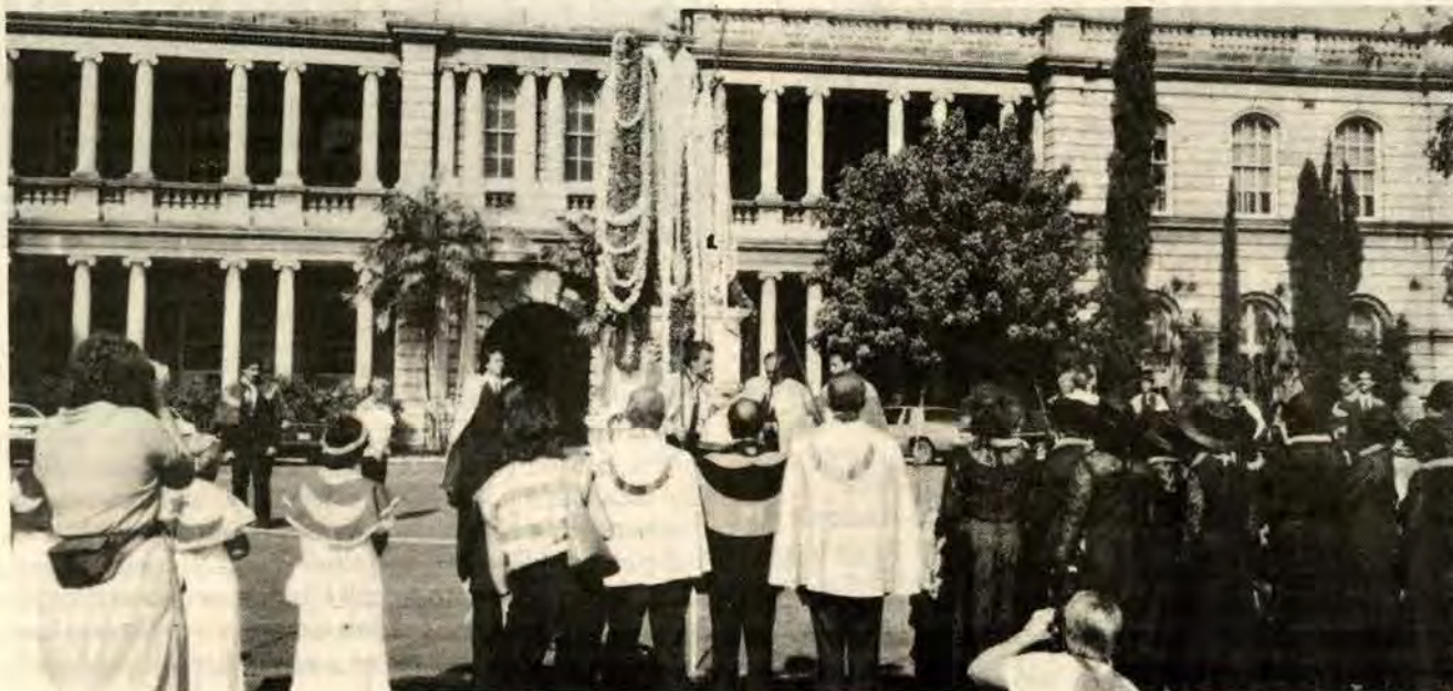
Members of the 'Ahahui Kaahumanu, pictured in their black uniforms at right, and members of other Hawaiian organizations are pictured at brief June 11 ceremonies held in front of the statue on Kamehameha Day. The program was sponsored by the Sons and Daughters of Hawaiian Warriors. Among strands of leis draped the night before on June 10 was a plumeria one measuring 13½ feet strung by OHA staff members.

Fresh 12-foot long leis again draped the King's statue. Despite heavy rains, they were put there the night before by several Hawaiian organizations, including the Office of Hawaiian Affairs.