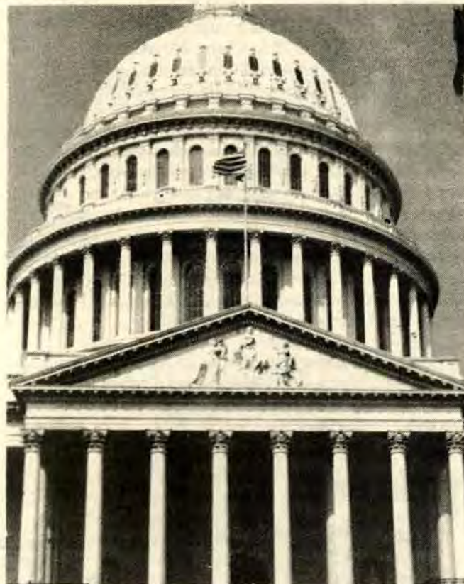
This is a view of the capitol dome in Washington, D. C. where its all happening for Hawaii, Hawaiians and the nation. For the first time since its inception, OHA is now represented in Washington right on the spot.

The native Hawaiian bills mentioned in this report still have a long way to go in the legislative process before they can become public law. The legislative process of Congress is complex. Briefly, bills are introduced in both Houses of Congress and referred to appropriate committees of each House respectively. Most of the