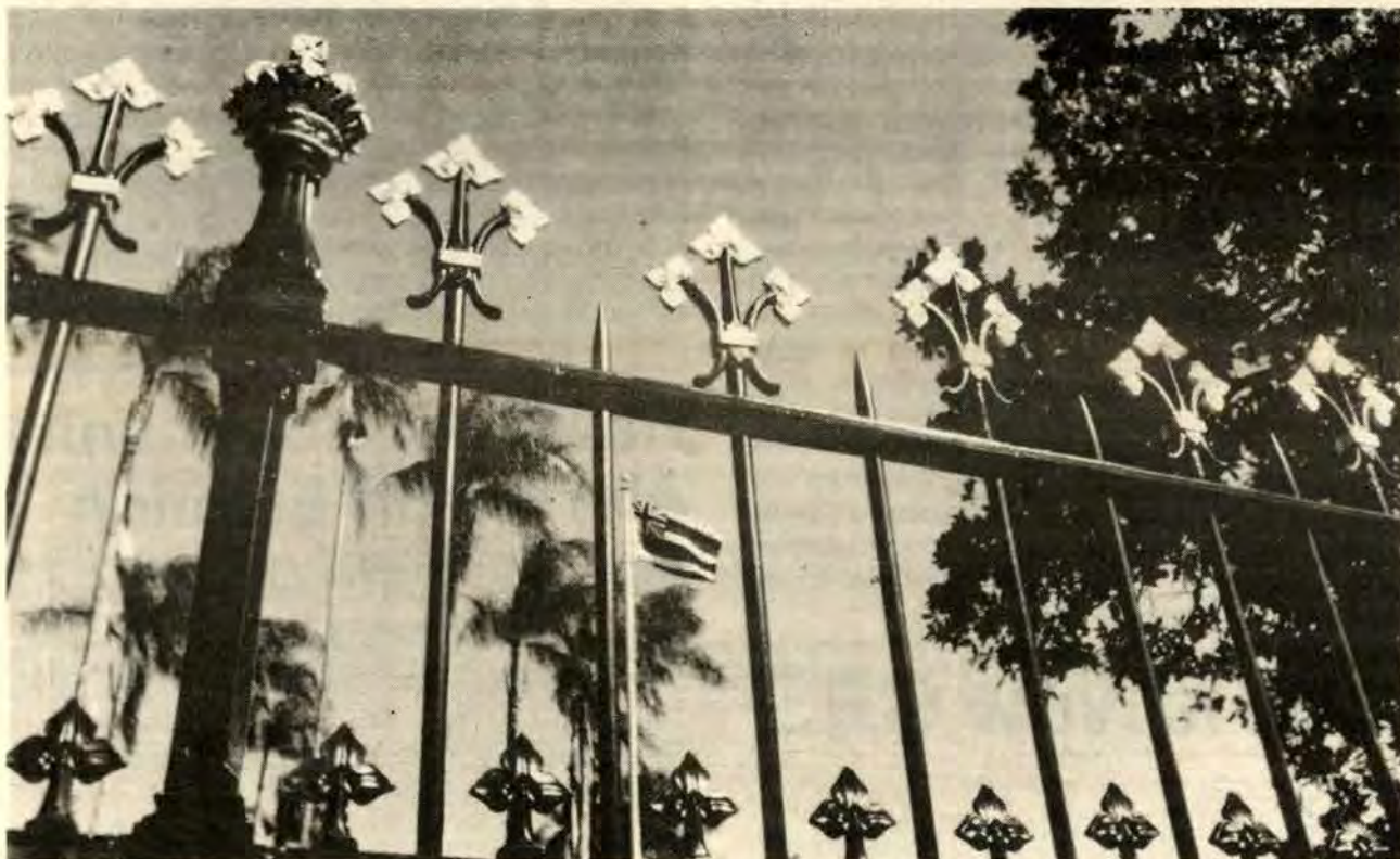
The restored Royal Mausoleum fence is decorated with 350 flower motif finials and 50 small crowns. The finials are a decorative element thought to have a religious connotation, and the crowns may be patterned after the crowns of the Hawaiian alii, complete with taro leaf replica. The fence was ordered to specification from the prestigious Coalbrookdale Co. in England by Kamehameha IV.

It was one of several places and individuals which received 1986 Preservation Awards during Historic Hawaii Foundation's annual meeting held last April.